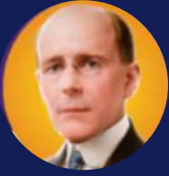
Rtn. Paul Harris FOUNDER OF ROTARY